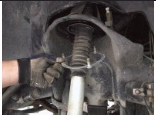
10. Remove the 3 bolt bracket