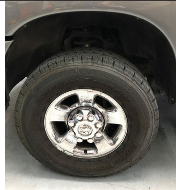
2. Stock rim and OE 285/70-17 tire