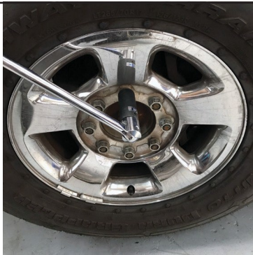
3. Follow instructions in the notes and remove front wheels