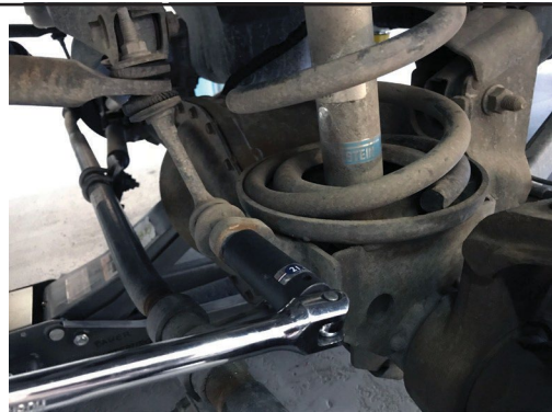
6. Support the front axle from the center of the axle. Disconnect the sway bar on one side