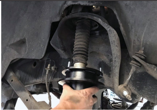
11. Install the Bison Offroad Coil Spring spacer and fasten with the supplied hardware