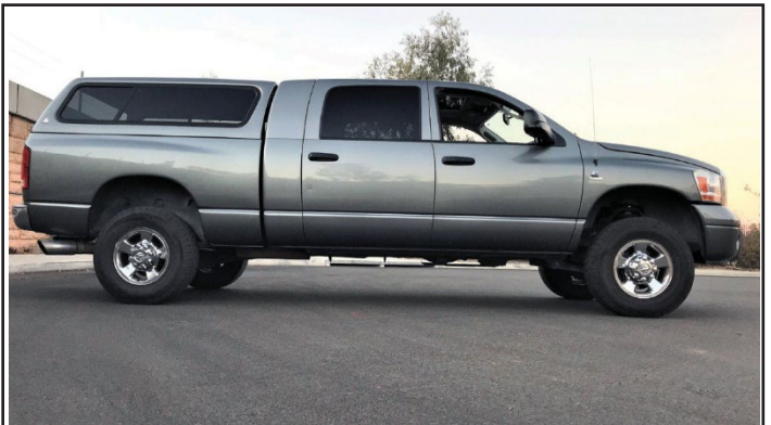
16. Your new Bison Offroad leveling kit will allow for 35" tires.