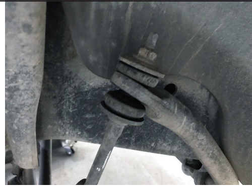
14. Reinstall the sway bar bracket.