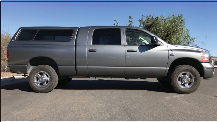
1. OE ride height 2006 MegaCab 4WD