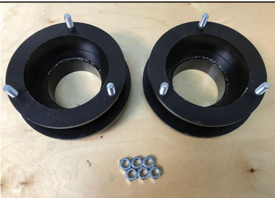
5. Bison Offroad Coil Spring Spacers