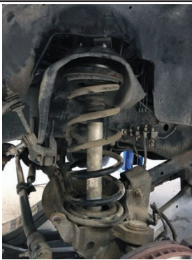
13. Install the coil spring and reconnect the lower shock mount. Raise or lower the floor jack as needed.