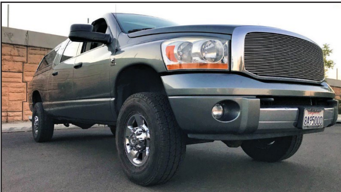
15. Follow the instructions in the Post Installation Instructions.