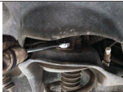
8. Disconnect the three top bolts holding the top coil spring bracket.