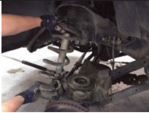
9. Remove the coil spring and rubber isolator cup