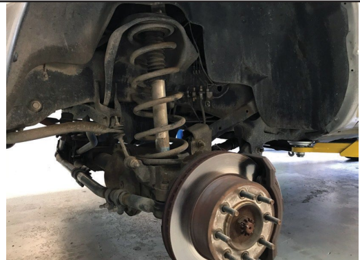
4. Front 4WD suspension shown with shock inside the coil spring