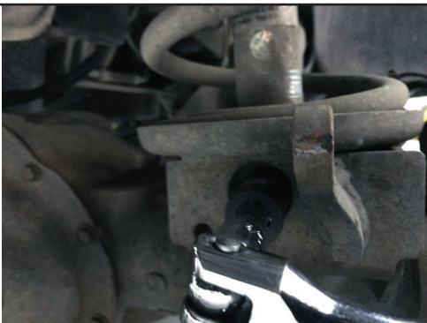
7. Disconnect the lower shock bolt. Use a heavy duty 1/2" breaker bar