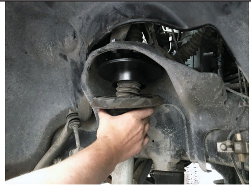
12. Reinstall the spring isolator cup